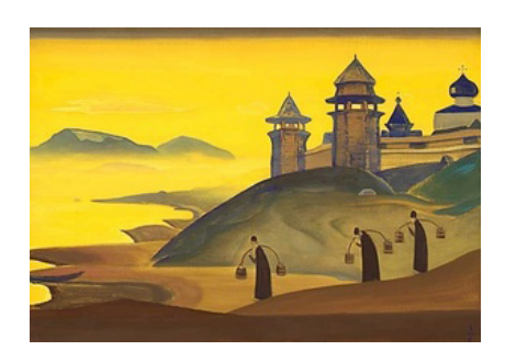
And We Labor by Nicholas Roerich

Networkers' Letter continued from page 1